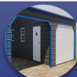
45° Trim Kits