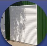
Roll up door