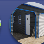
45° Trim Kits