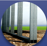
Double leg system