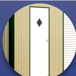
Walk in door