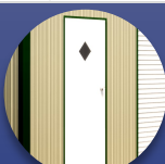
Walk in door