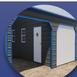
45° Trim Kits